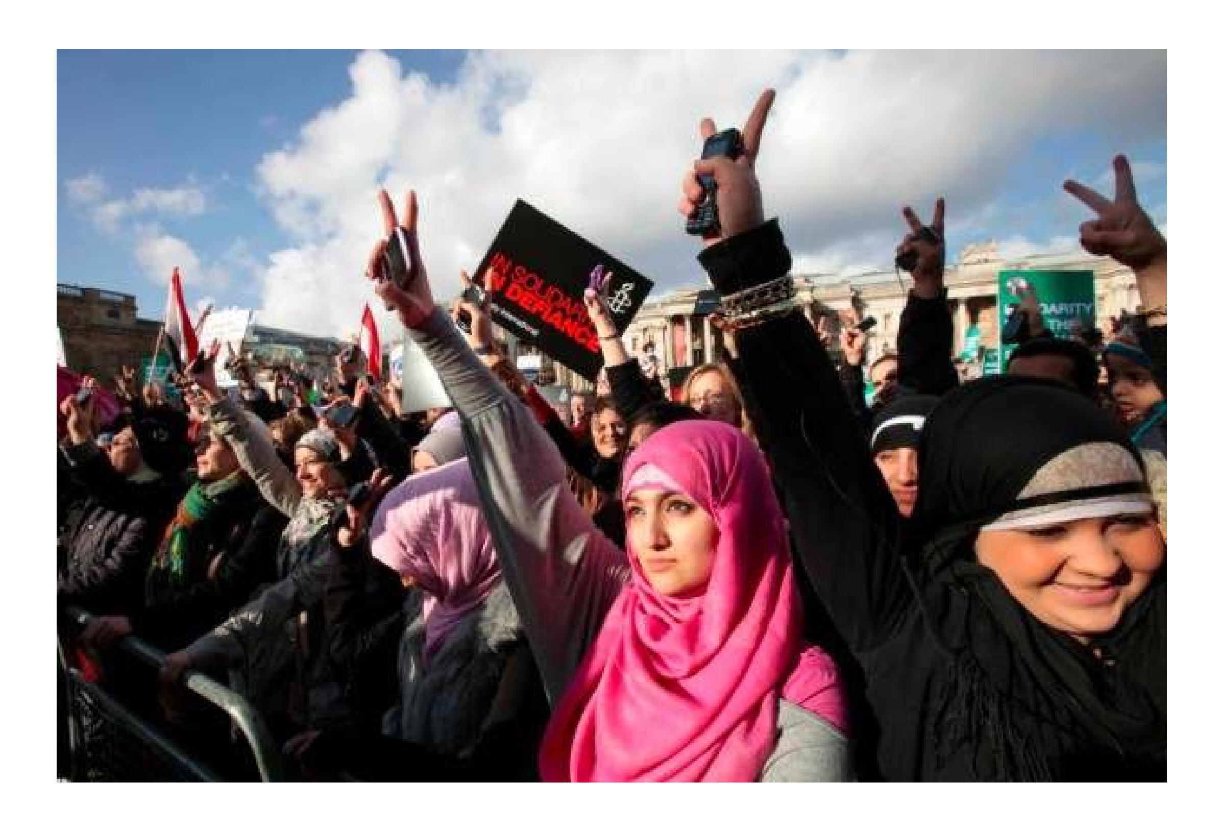
Tahrir Square, Cairo > Mobarak > Arab Spring