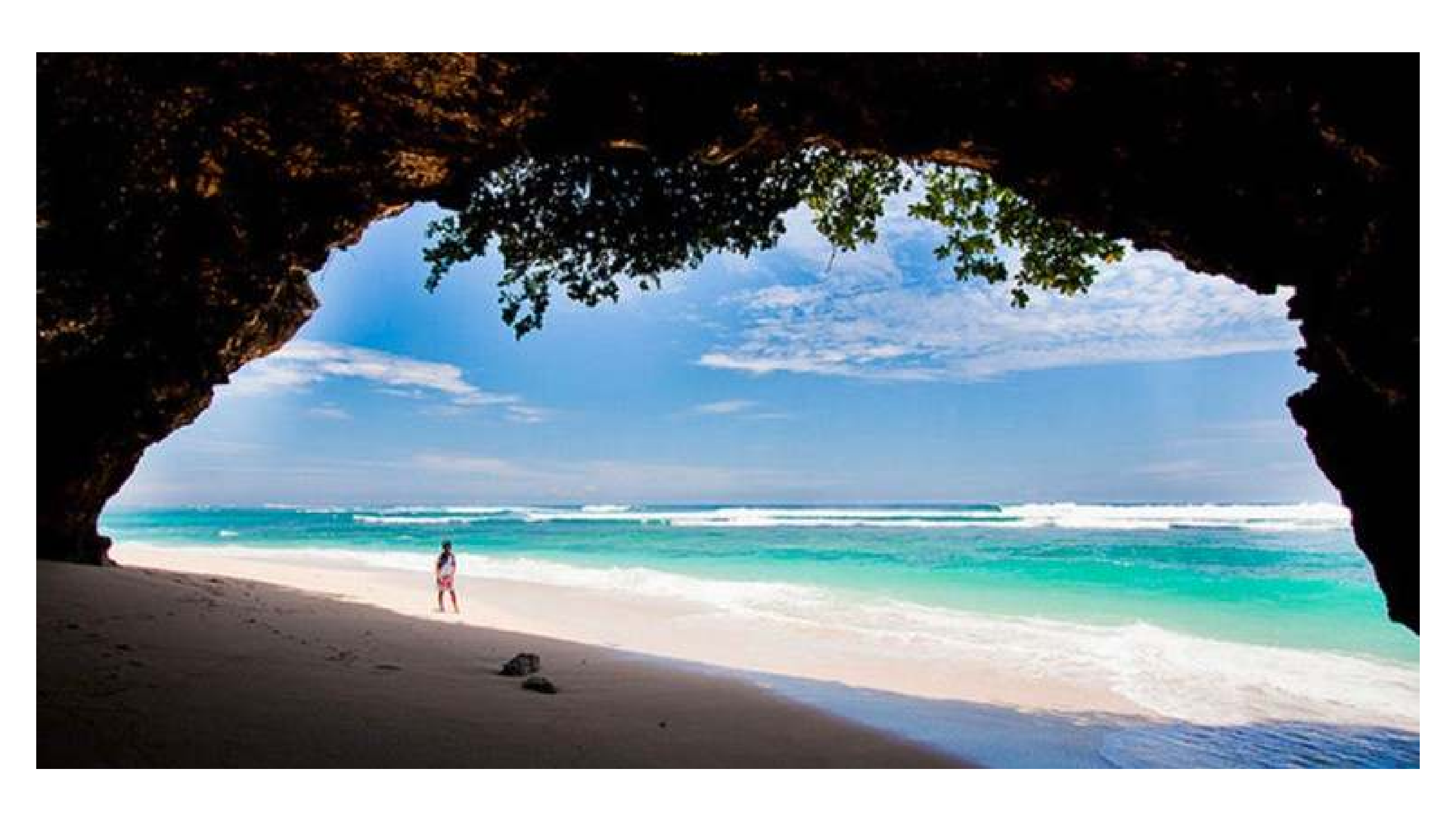
Bali island of the Gods