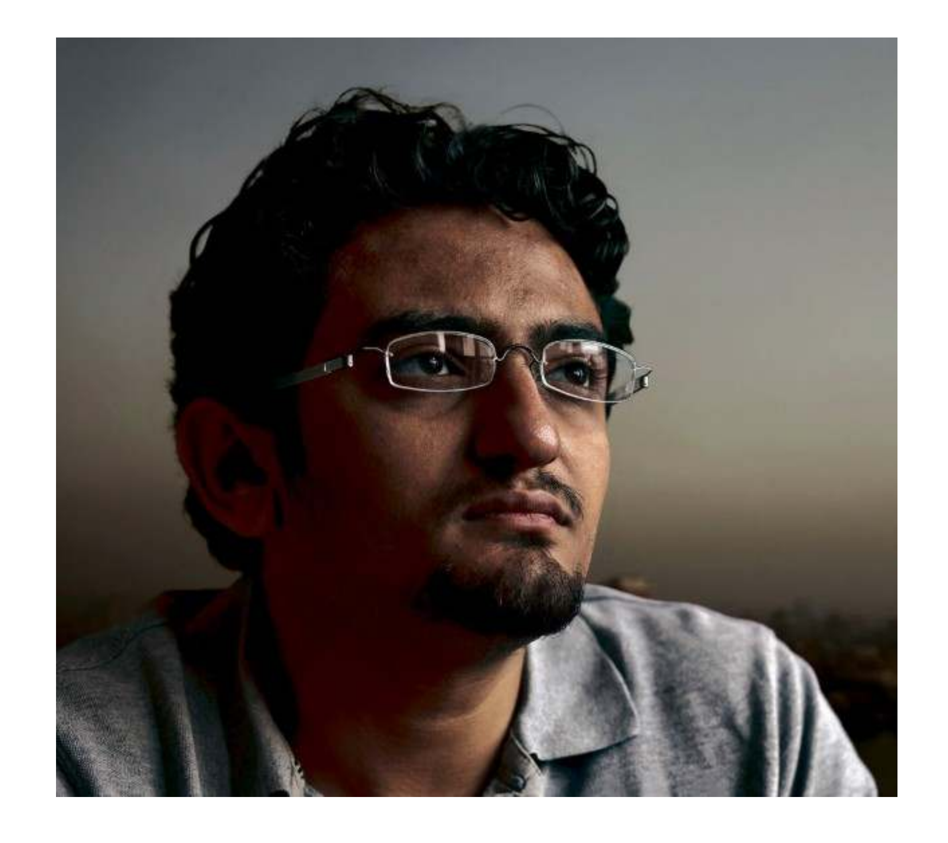
Wael Ghonim > Facebook page"Kullena Khaled Said"