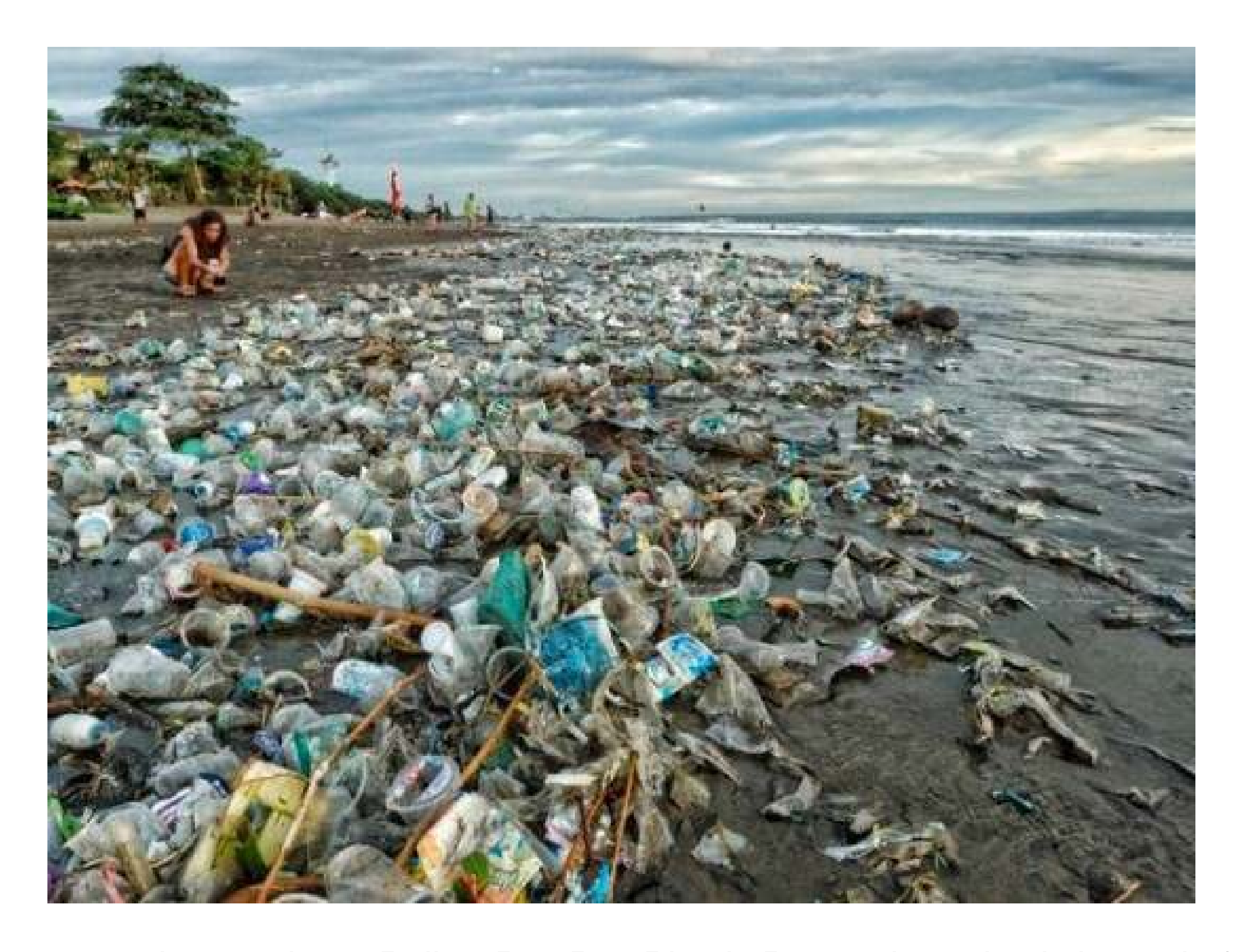
2 sisters created campaign > Bali > "Bye Bye Plastic Bags"> ban plastic by end of 2018