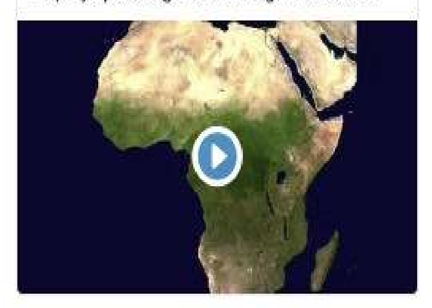
10:32 AM - Aug 15, 2018

Hi @LeoHickman, here's how #Niger is fighting emigration with #reforestation. Across #Africa, communities are tackling #climatechange. But these local successes need to be shared to inspire others. Will you make Africa greener? Help by spreading the word. #glfnairobi2018