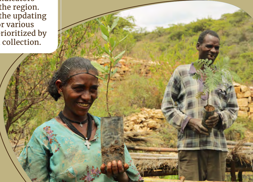
Forest landscape restoration in Ethiopia.

OFESA's database provides information on country-specific drivers of deforestation in Kenya, Uganda, Tanzania and Mozambique, and will be updated to include Ethiopia. The information includes how the indicators are monitored, and who is doing the monitoring.