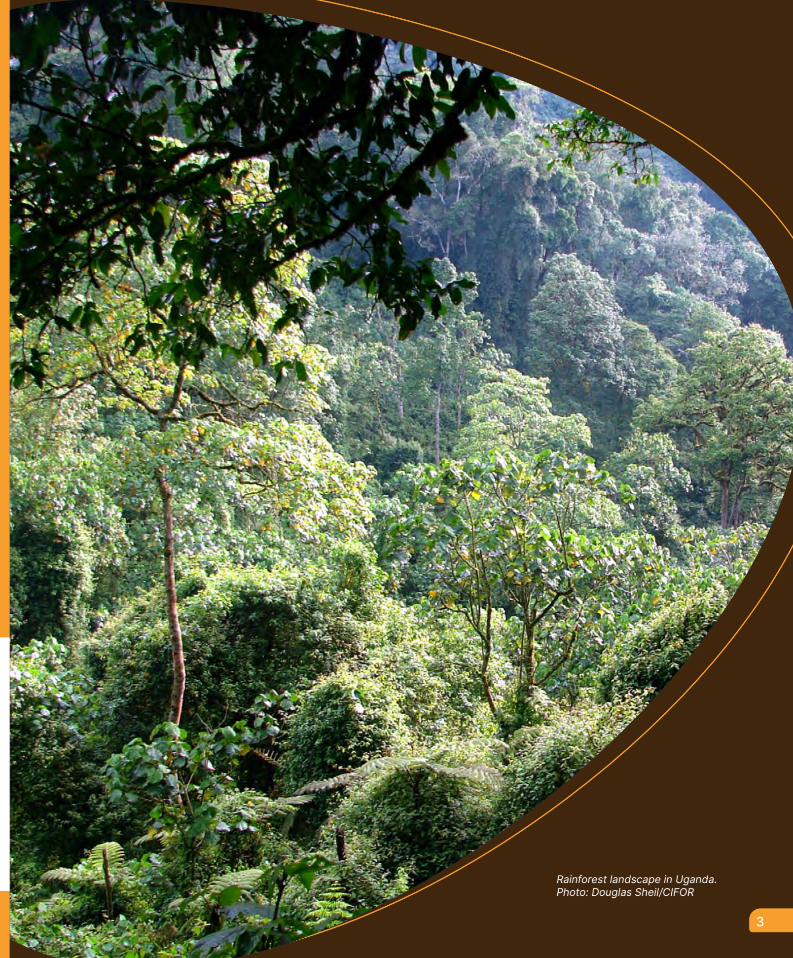
Rainforest landscape in Uganda.

One of the key expected outputs of OFESA is the State of the Forests report, a publication to be developed in collaboration with partner countries. The State of the Forests will be the first of its kind to present comparable multi-country information on priority themes aimed at providing a regional overview of the current situation of forests.