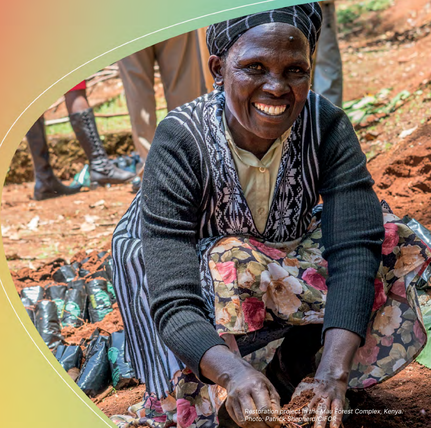
Restoration project in the Mau Forest Complex, Kenya.