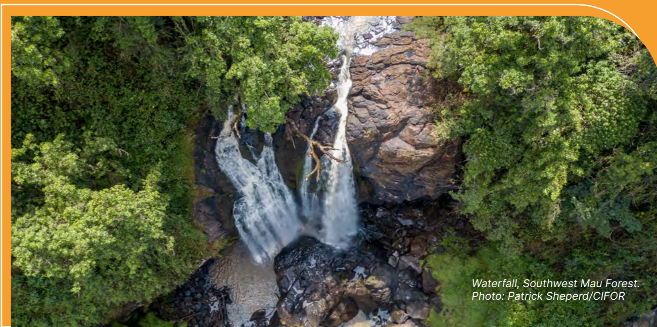
Waterfall, Southwest Mau Forest.