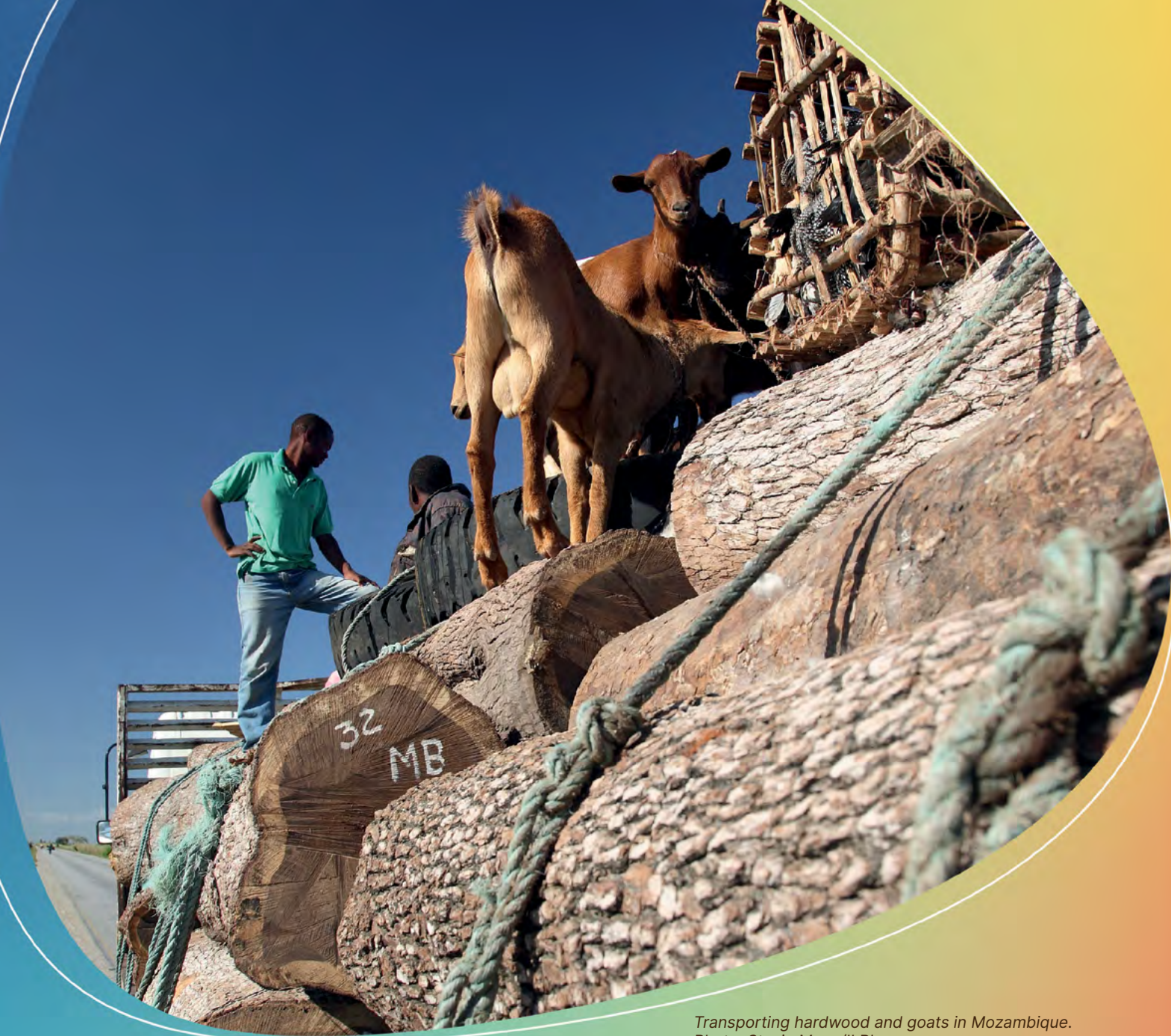
Transporting hardwood and goats in Mozambique.

To learn more about the East and Southern Africa Forest Observatory, please visit: