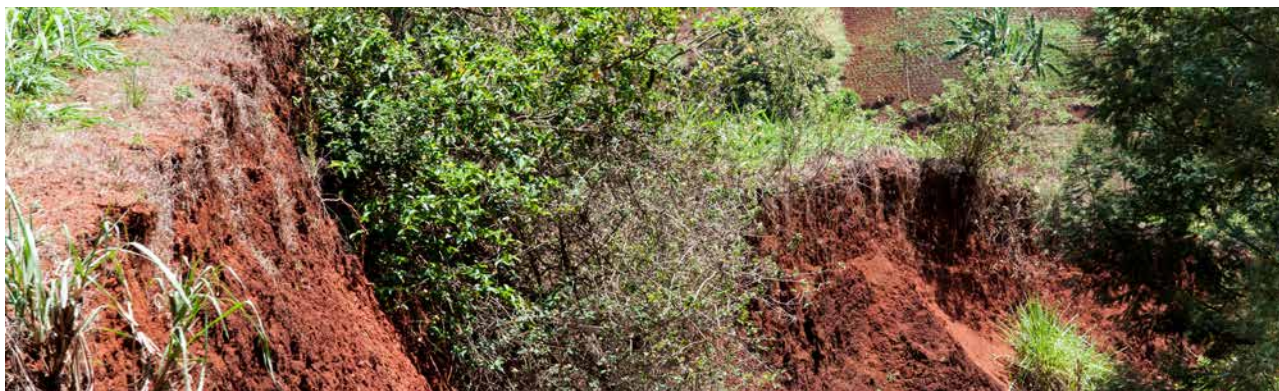
Figure 3. Women in the Tana River Basin rely on Napier grass for livestock feed. Planting Napier grass can also help prevent soil erosion.

This work was carried out under the CGIAR Research Program on Water Land and Ecosystems with support from CGIAR Trust Fund donors ( https://www.cgiar.org/funders/ ) and Ohio University. It was previously presented at the Annual Meeting of the American Association of Geographers (AAG) in April 2018.