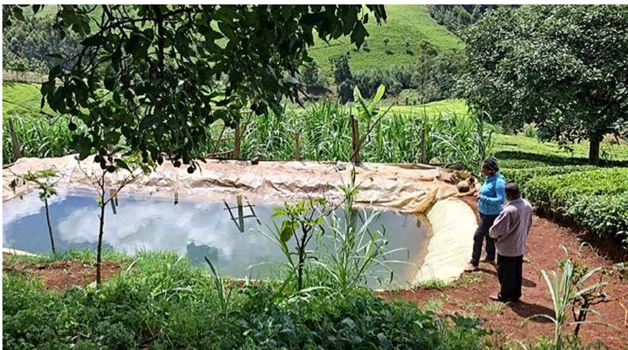
Figure 1. Example of a water pan in the NWF region.

The cost of the pan liner is shared between the farmer and the NWF, while technical advice on its placement is provided by the NWF. The farmer is responsible for building the pan. This pan is filled in the rainy season, and the water is used in the dry season, allowing the farmer to increase crop production, while reducing pressure on the water supply then. Poorer households and female-headed households often lack the labor requirements to build water pans or the financial means to hire labor.