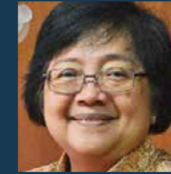
H.E. Siti Nurbaya

Inger Andersen is Executive Director of the United Nations Environment Programme (UNEP).