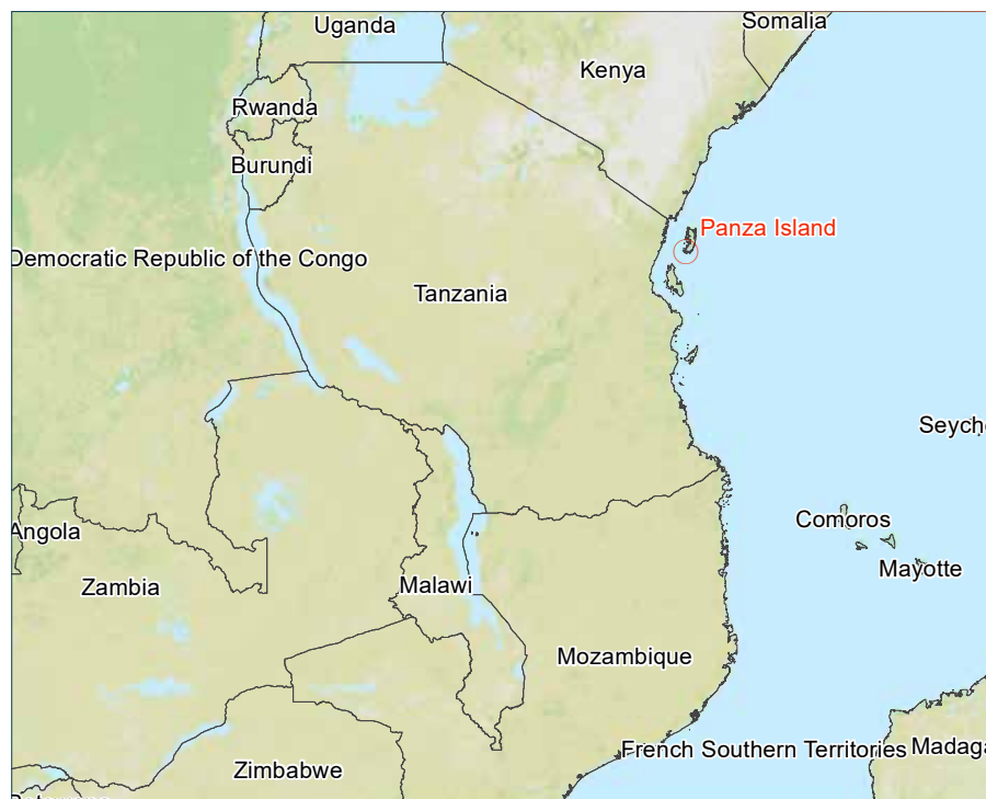
Figure 1. Location of Kisiwa Panza.

Rising sea levels, and degradation from unsustainable harvesting of terrestrial trees and mangrove forests, were to blame for the macabre event. During high tides that coincided with heavy rains, salt-water flooding had become increasingly common; and, increasingly intense.