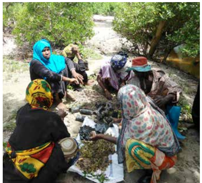
Photo 1. Women members of JSEUMA sort mangrove propagules of Avicennia marina for nursery planting.

Community members are also encouraged to use energy-saving cooking stoves, and build houses with concrete blocks instead of wooden poles, to reduce pressure on wood resources. Further, a patrolling unit works to ensure that people don't harvest timber illegally in the reforestation areas, particularly within the mangroves.