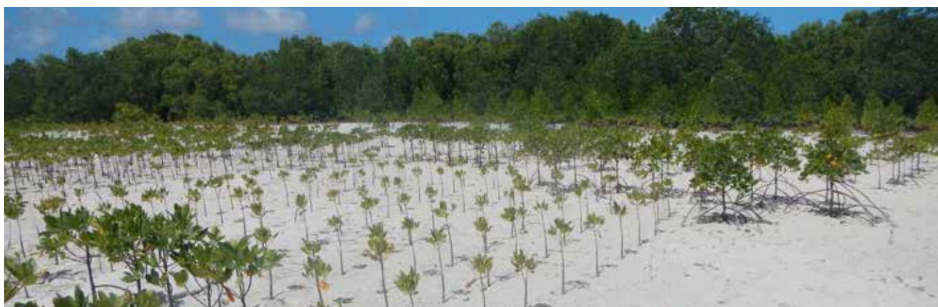
Photo 2. JSEUMA mangrove rehabilitation site on the east coast of Kisiwa Panza.