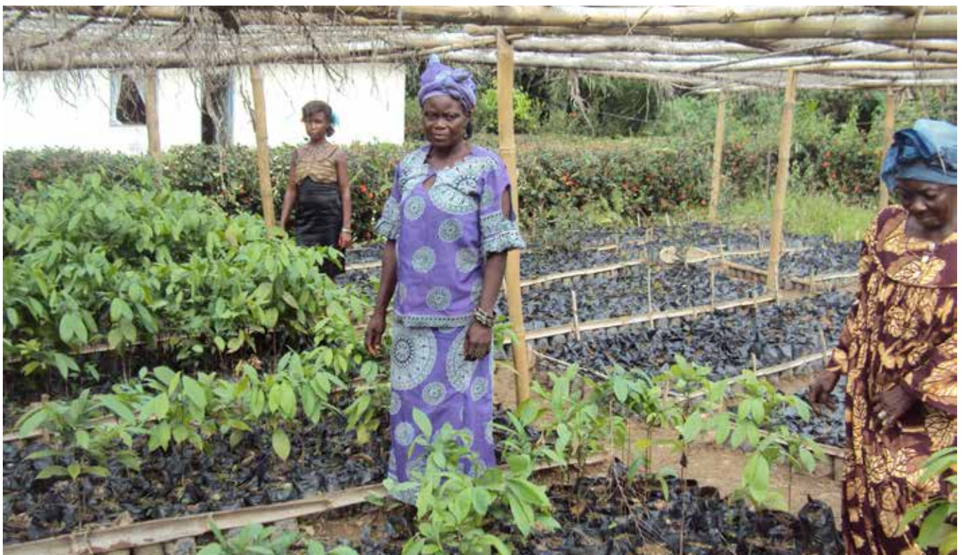
Photo 1. Women's tree nursery at Londji village.

Later, in 2017, as part of a wider project on women's leadership in sustainable forest and farm management, women were supported to plant orchards in the coastal forest villages of Sanaga, Dibamba, Ngwei and Pouma. Through this project, seven hectares were planted over three months; the survival rate was 65% in this case, given it was the end of the rainy season and the beginning of a period of drought.