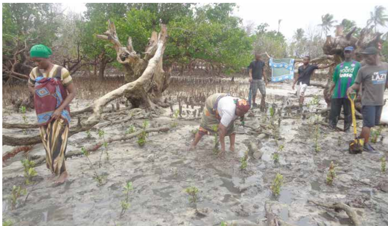
Photo 1. Planting mangroves in Gazi Bay.

Increasing sedimentation in some of the reforestation sites is also a concern, because mangroves are very sensitive to slight changes in physical conditions. As a result, MP has been unable to meet its replanting targets for the past two years.