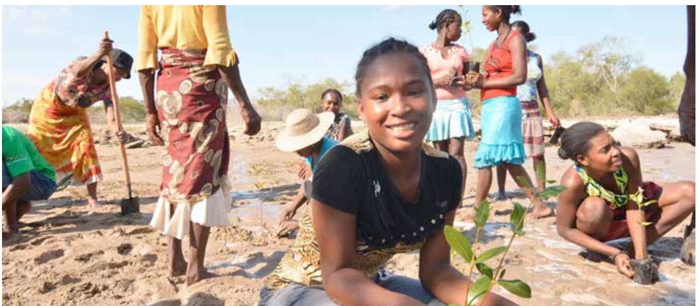
Photo 2. Replanting mangroves during Mangrove Day in Befandefa, Velondriake.

Treasurer of the Local Association of Mamisoa, Ambaro-Ambanja Bay, North-West Madagascar