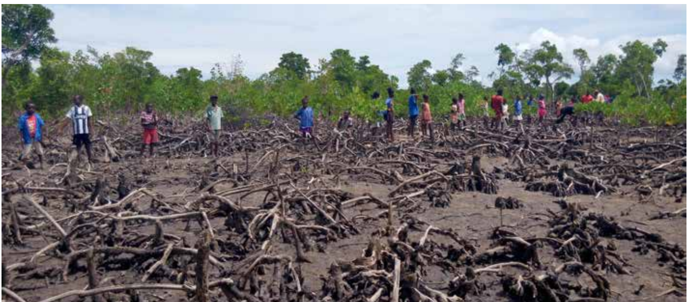
Photo 1. Mangrove replanting by schools in Ambanja, Northwest Madagascar.

Participation has a gendered slant. In Baie des Assassins, women represent the majority – 73% – of those involved in the reforestation activities because in the southwestern Vezo culture, men consider that tree planting is women's work and beneath them. This belief is not shared in the Sakalava culture in the north-west of the island, so in Ambaro-Ambanja, around 48% of participants in tree-planting are men.