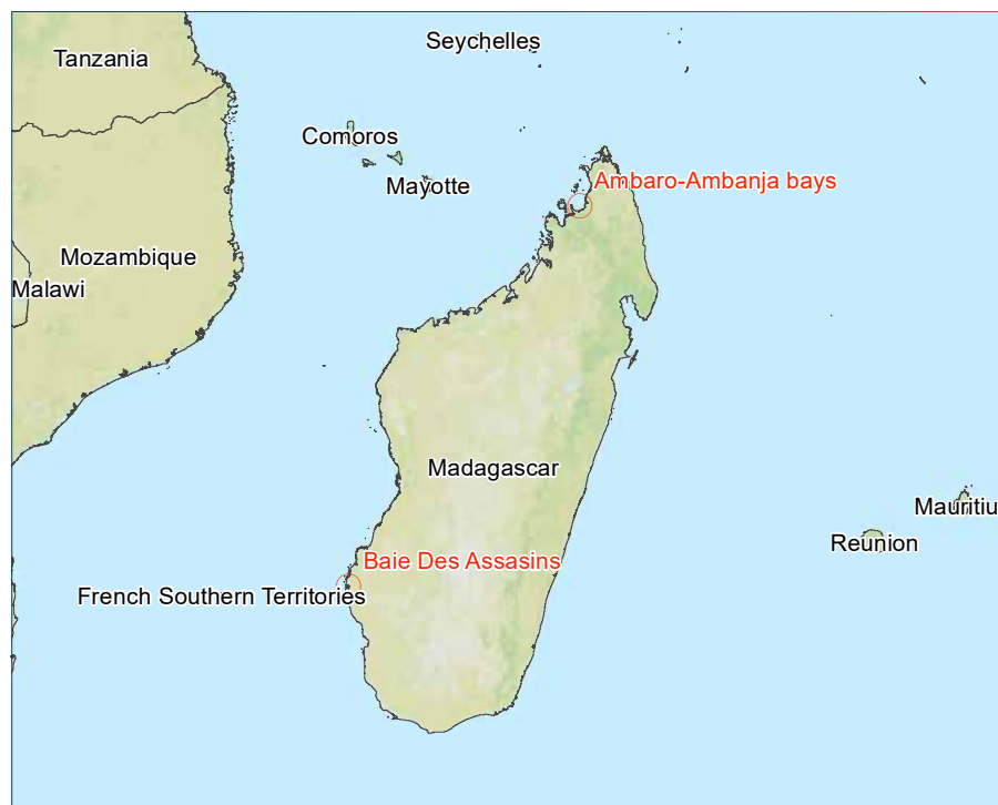
Figure 1. Mangrove rehabilitation sites in the North and Southwest.