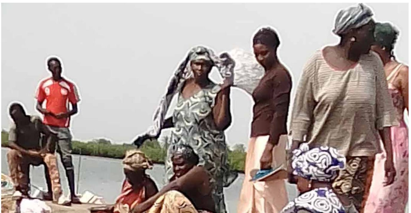
Photo 1. Women of Bassoul gather to organize for mangrove monitoring.

WAAME carries out education and training programs to ensure local communities are on board and well equipped to sustain the reforestation efforts. They are trained in basic species biology and replanting techniques, and educated on the importance of mangrove conservation at all levels. Popular theatre, football tournaments and exchange visits between communities help to create the connections and shared motivations to make a difference for the mangrove forests in the Delta and beyond.