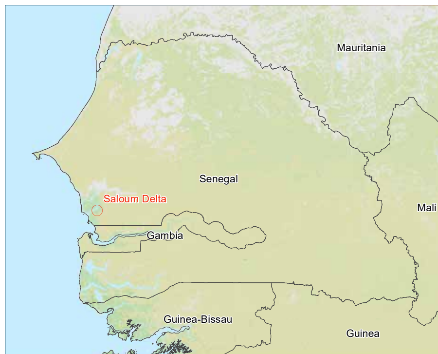
Figure 1. Location of mangrove rehabilitation efforts.

The Saloum Delta, in the Fatick region in the west of Senegal, expands over 300,000 hectares, and is a zone of global economic and ecological importance. In 1980, mangroves covered almost 60% of the delta. But since then, the forest has steadily decreased, through drought impacts and over-exploitation: by 2006, this figure had dropped to around 38%.